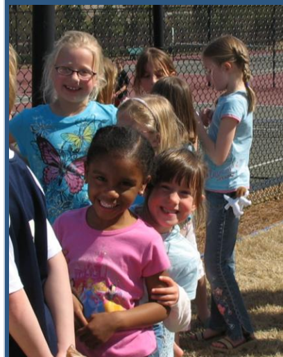
2008 Easter egg hunt