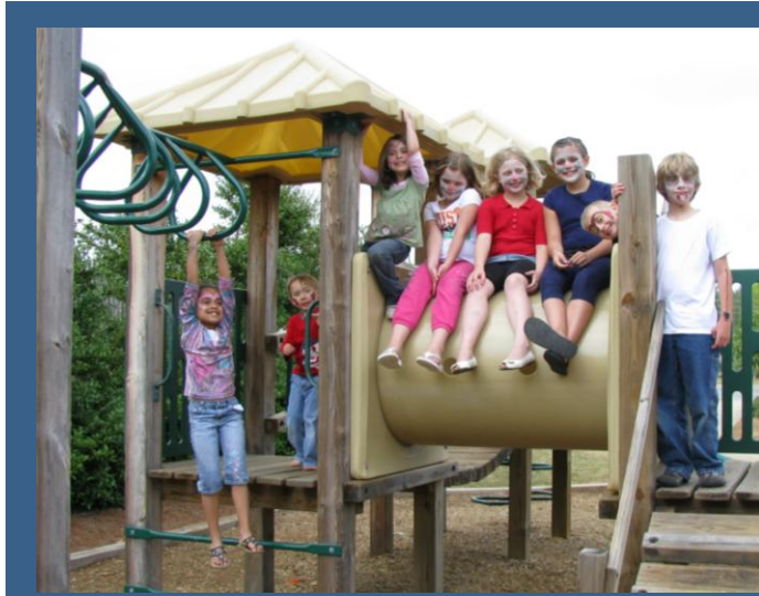
2009 Easter egg hunt